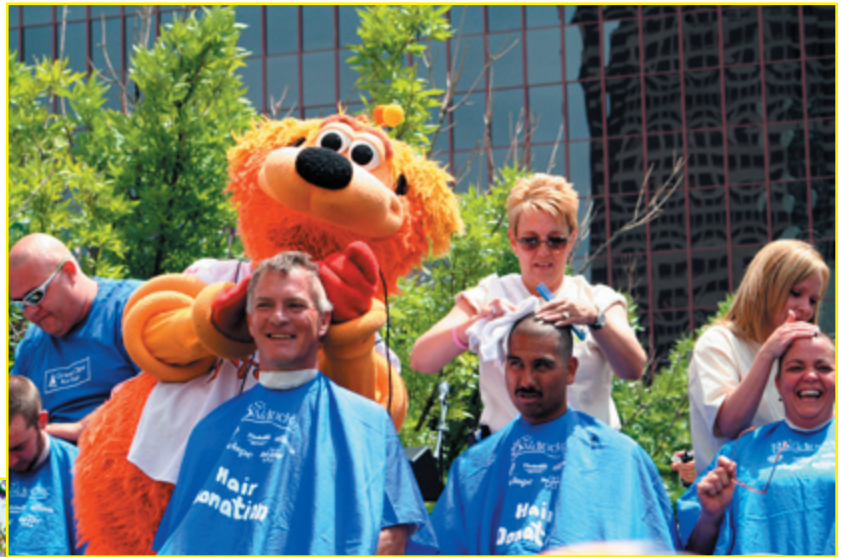
Above: Orbit, the mascot for Raley's, does a little shaving at the St. Baldrick's event in downtown Albuquerque.